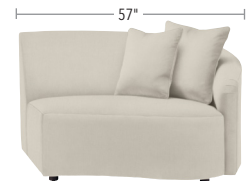
20-1087 RIGHT-FACING CURVED WEDGE

SECTIONAL PIECES ARE AVAILABLE IN BOTH LEFT AND RIGHT CONFIGURATIONS. LEFT- AND RIGHT-ARM SECTIONAL PIECES CREATE A CURVED CONFIGURATION. EACH PIECE IS 32"H WITH 37" EXTERIOR DEPTH. SEAT HEIGHT: 18". SEAT DEPTH, RIGHT- AND LEFT-FACING CURVED WEDGE: 25" ON OUTERMOST SIDE, 23" IN CENTER. SEAT DEPTH, CURVED WEDGE: 23".