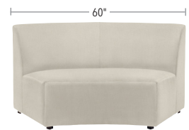
20-1089 CURVED WEDGE