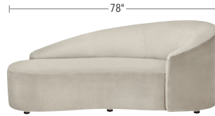
20-1090 RIGHT-FACING CHAISE