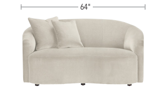
20-1084 PLATFORM SEAT SOFA

SOFAS AND CHAISES: 32"H, SEAT HEIGHT 18". SOFA: SEAT DEPTH-25" ON OUTERMOST SIDES, 23" IN CENTER. EXTERIOR DEPTH-37". CHAISE: SEAT DEPTH-27". EXTERIOR DEPTH-40".