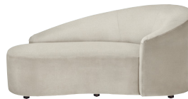
20-1098 RIGHT-FACING CHAISE