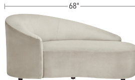
20-1099 LEFT-FACING CHAISE