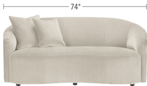
20-1085 PLATFORM SEAT SOFA