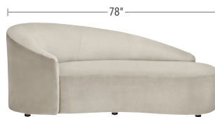
20-1091 LEFT-FACING CHAISE