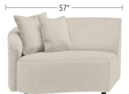
20-1088 LEFT-FACING CURVED WEDGE