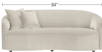
20-1086 PLATFORM SEAT SOFA